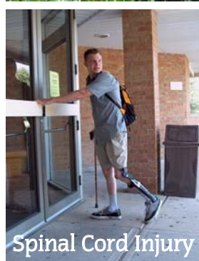
Spinal Cord Injury